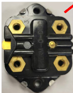
High limit tripped normal condition.