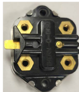
High limit tripped metal clip protrudes and extends rod.