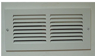
Slide Vent Cover: One is included with every sauna material kit.