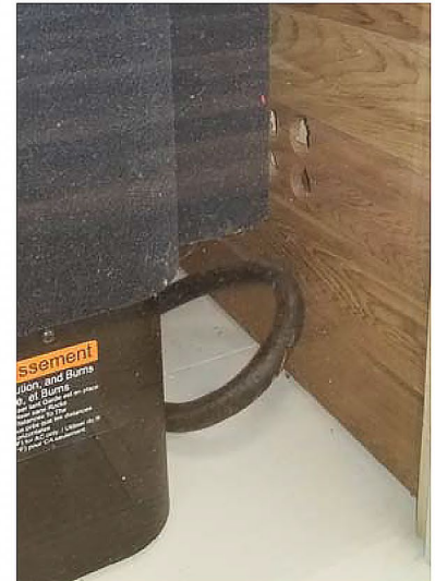
Fixed cedar grill: Optional with LK Plus. Incl with LK Premium

OUTLET is located high on the wall, diagonal from the inlet.