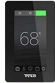
Elite (Cloud-WiFi) Control

You can control light when using Tylo sauna heater with Pure or Elite control. (Tylo control not dimmable)