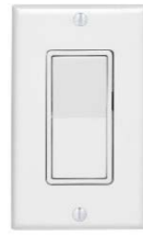
Standard, Non-Dimmable light switch (By Others)