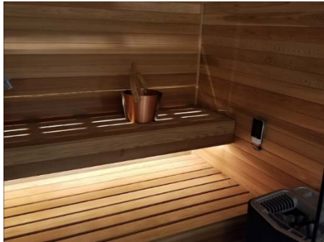
Pages 17-20: Quick Install Guides

SaunaChrome™ White LED Strip Lighting Using SaunaChrome Control or Switched 115vac Power from your Sauna Control